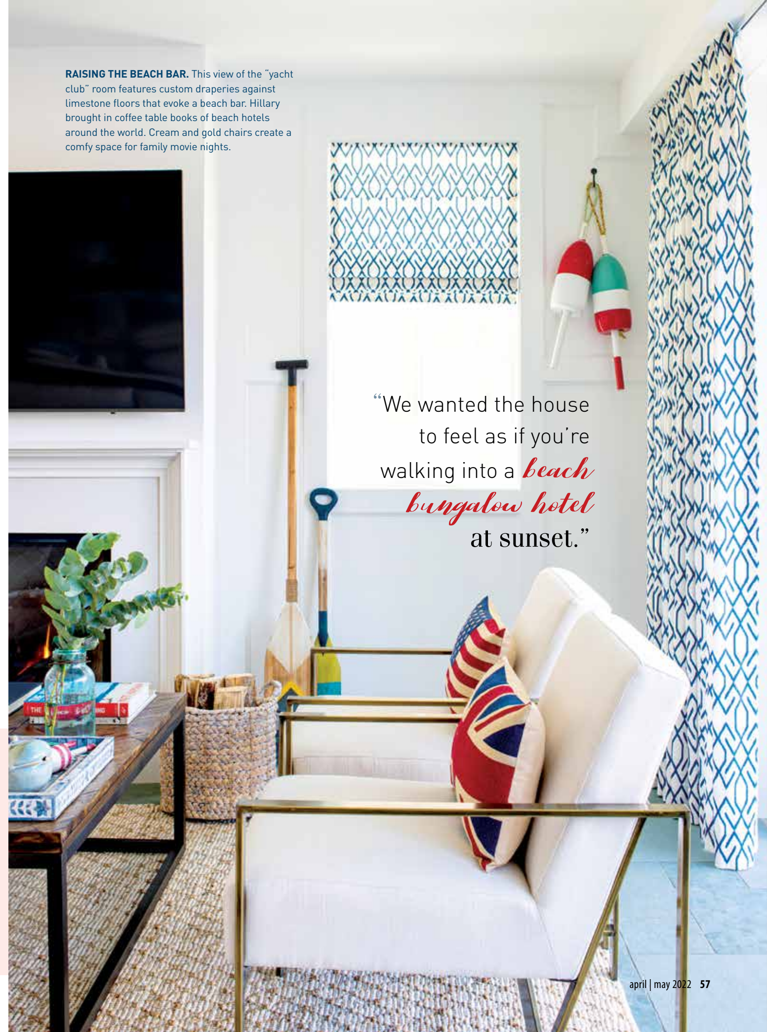
RAISING THE BEACH BAR. This view of the “yacht club” room features custom draperies against limestone floors that evoke a beach bar. Hillary brought in coffee table books of beach hotels around the world. Cream and gold chairs create a comfy space for family movie nights.

“We wanted the house to feel as if you’re walking into a beach bungalow hotel at sunset.”