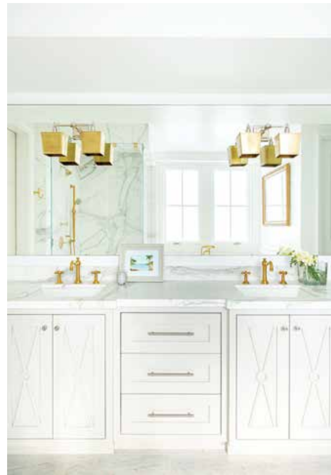
|TOP| SWEET DREAMS. The bunk room includes custom lighting for nighttime reading and is great for sleepovers. |ABOVE, LEFT| SMALL, BUT STYLISH. The powder room sports a dresser from Wayfair that was repurposed as a vanity. |ABOVE, RIGHT| BATHING BEAUTY. The primary bath features custom lighting and Calacatta marble slabs in the shower. Gold hardware contrasts with the white and marble elements.